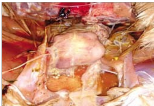
Fig.1. Kidneys appearing as a single, hard, nodular mass