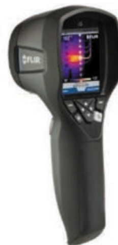
Fig. 2. FLIR TG 165 camera model