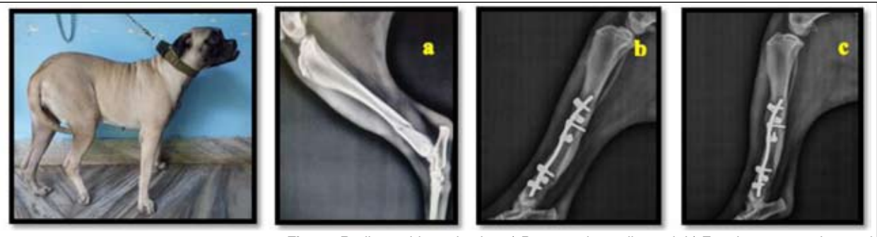
Fig.1 Preoperative photograph showing non-weight bearing lameness