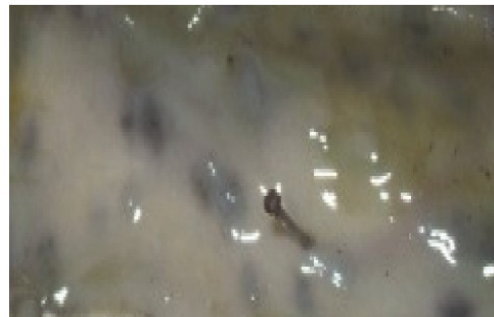
Fig.2 Nodules on intestinal mucosa