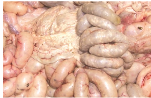
Fig.1 Gross lesions on surface of small intestine

All the animals were administered potassium antimony tartarate (tartar emetic) @1.25mg/kg body weight intravenously in 20 ml distilled water three times on alternate days. Supportive therapy included parenteral antibiotics, crystalloids and vitamins. Grazing on water logged areas was stopped. Mortality continued for one more week, after which no more calves succumbed. Marked improvement was noticed in appetite and general health of the calves.