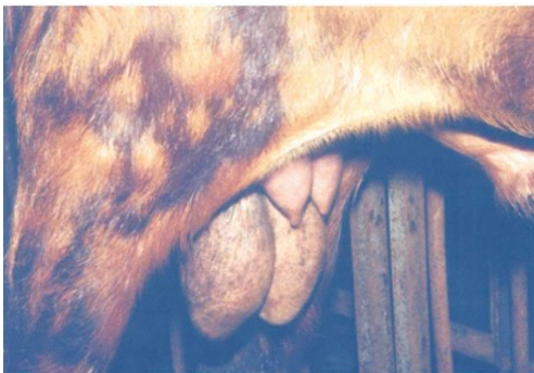
Fig.1. Early appearance of enlarged glandular tissue.