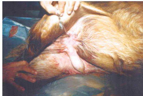
Fig. 3. Individual surgical removal and closure presented to the Veterinary Polyclinic, Kunnankulam with a history of abnormal growth near the testes. The buck was purchased four months before and was being utilised as a stud. It had showed normal male phenotype from birth to puberty and had sired 11 kids before purchase by the present owner. Enlargement of mammary glands became apparent two months after purchase (Fig 1). At the time of examination both glands were well developed (Fig.2) with secretion of approximate yield of 25 ml of milk from each Appetite, activities and libido of the animal were unaffected. Mastectomy of the animal was undertaken at the request of the owner of the animal.

Xylazine @ 0.1mg/kg body weight given intramuscularly, followed by local infiltration of 7ml of xylocaine 2% solution provided sedation and analgesia. Elliptical incisions were placed below the base of each half with retention of enough skin for complete apposition after removal. Blunt dissection was used to separate the gland from the skin. External pudental artery and external pudental vein were ligated. Both glands were removed separately (Fig 4). Scrotal/mammary lymph nodes were not resected. Subcutaneous sutures with plain silk (No.2) were placed in order to obliterate dead space. Continuous sutures with braided silk (No.2) were used for