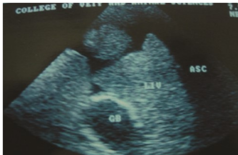
Fig.1 Anechoic area suggestive of fluid and irregular hepatic margins.

Serum biochemistry revealed hypoproteinemia (4.4g/dl) with hypoalbuminemia (1.3g/dl) and normal globulin level (3.1g/dl) reduced A:G ratio (0.4), hypourcemia (BUN-8mg/dl), normal bilirubin levels (total-0.2mg/dl, direct-0.1mg/dl, indirect-0.1 mg/dl) and elevated serum ALP level (609U/L). Ascitic fluid collected was found to be a clear transudate with protein level 0.2g/dl.