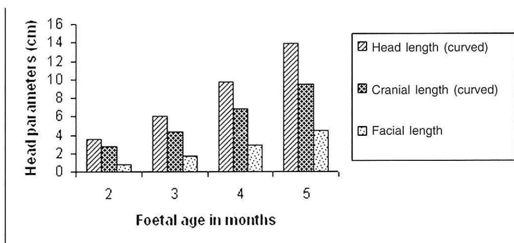
Fig 1. Relation between age and head parameters in goat foetuses

selected body parameters at different stages of gestation is illustrated in Fig. 2. All the head parameters showed an increasing trend with the advancement of age. Curved length of the cranium was greater than that of the face in all the age groups. This may be due to the caudodorsal curvature of the head than the face. Langman (1981) opined that this was caused by the virtual absence of the paranasal sinuses and the small size of jawbones. Craniofacial ratios were 3.4:1, 2.6:1, 2.3:1 and 2.1:1 during second, third, fourth and fifth month, respectively. Parmar et al. (1997) reported that the approximate craniofacial length ratio was 2:1 during early, middle and